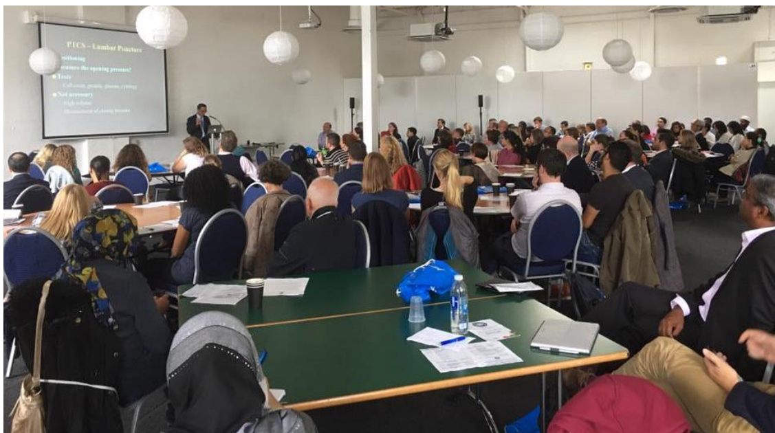
Delegates attending the CSF Disorders day 2017.